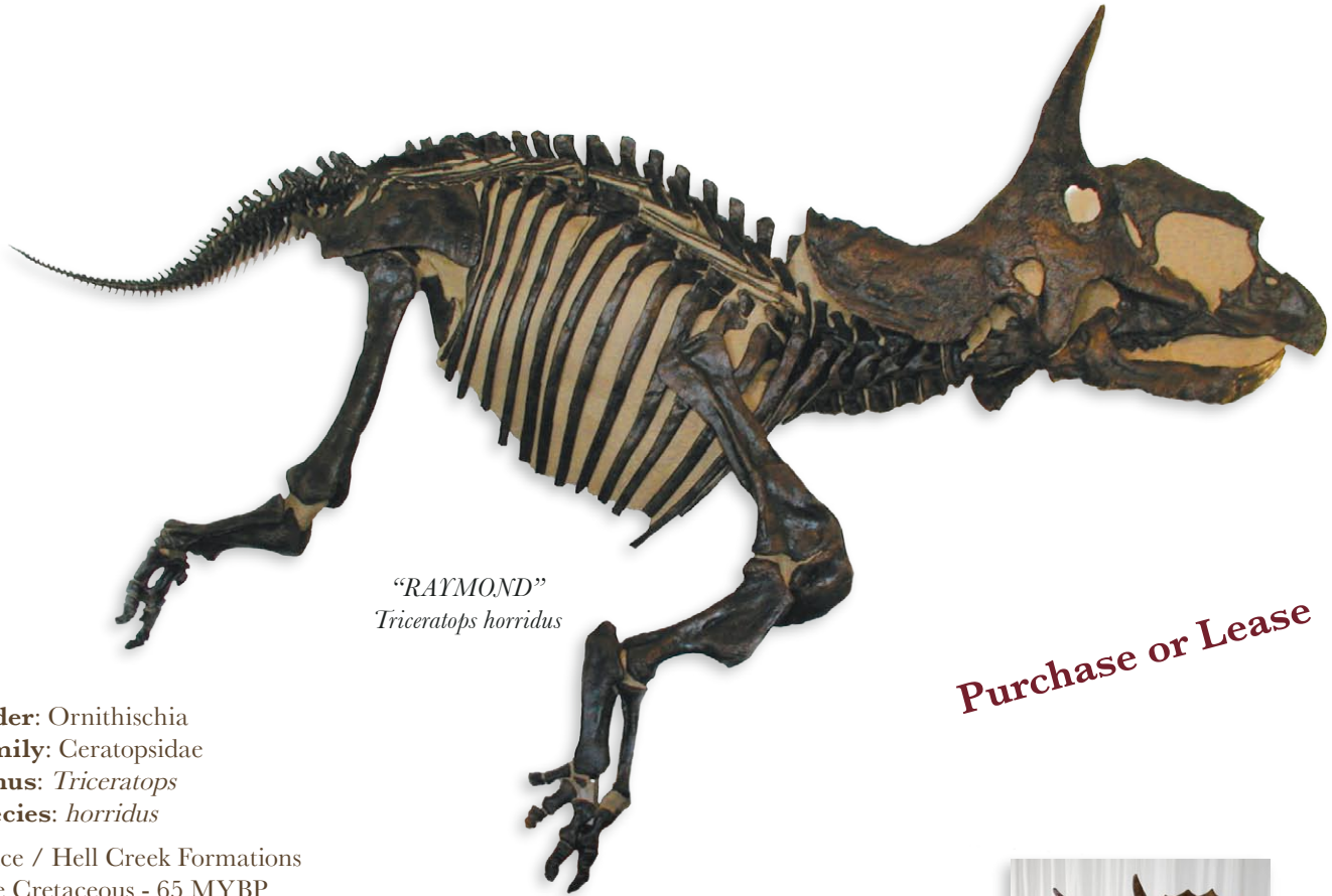
“RAYMOND” Triceratops horridus