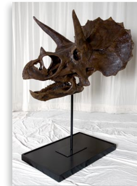
Replica Triceratops horridus Skull

Lance / Hell Creek Formations Late Cretaceous - 65 MYBP Wyoming, Montana & the Dakotas